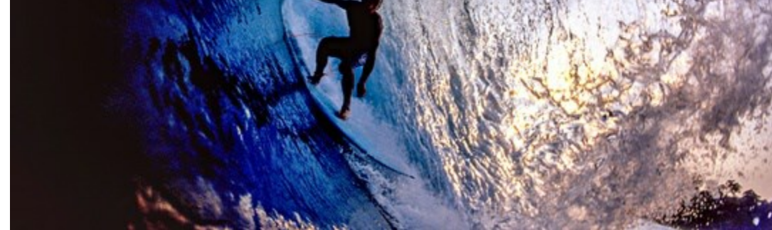
Surfing Pulau Panaitan

Last week's riddle: Throughout Friday, Hanna asks her mother the same four-word question. On each occasion, her mother gives her a different answer. What is the question? Answer: "What time is it?"